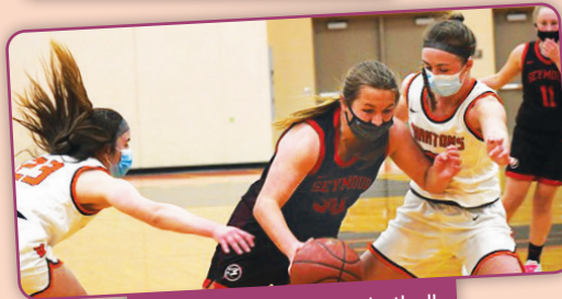
High School Girls Basketball, West De Pere vs. Seymour