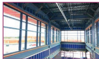
Windows around the main entrance corridor at the Intermediate School