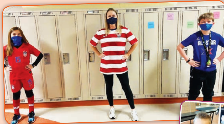
Hemlock Creek Elementary- Wear patriotic red, white, and blue for Red Ribbon Week

A Vision of Pride and Excellence HOME OF THE PHANTOMS