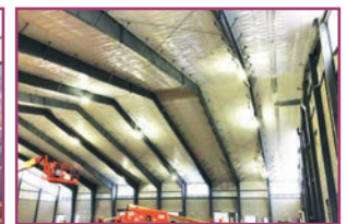
Interior of the athletic facility at the High School

WEST DE PERE 2020-2021 AND 2021-2022 SCHOOL CALENDARS ARE AVAILABLE AT WWW.WDPSD.COM (ABOUT THE DISTRICT, DISTRICT CALENDAR)