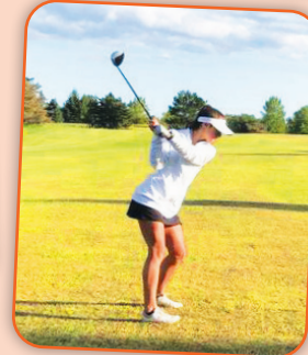
High School Girls Golf shot a 196 at Vernon in Oconto on September 18, 2020