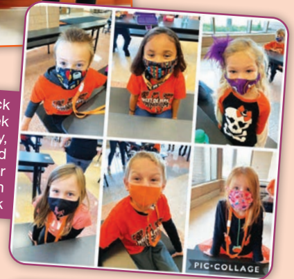
Hemlock Creek Elementary, Orange and Black day for Red Ribbon Week