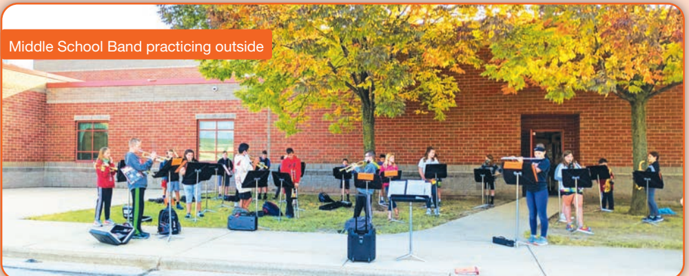
Middle School Band practicing outside