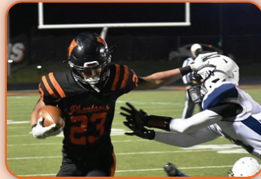
High School Football, West De Pere vs. Waupaca