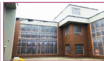
Courtyard at the Intermediate School