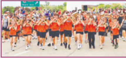
Middle School marching band dazzled the community during the Memorial Day Parade