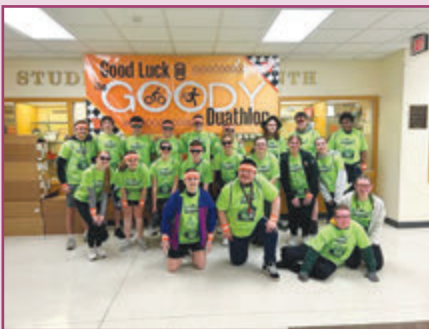
High School students competed in the Goody Duathlon