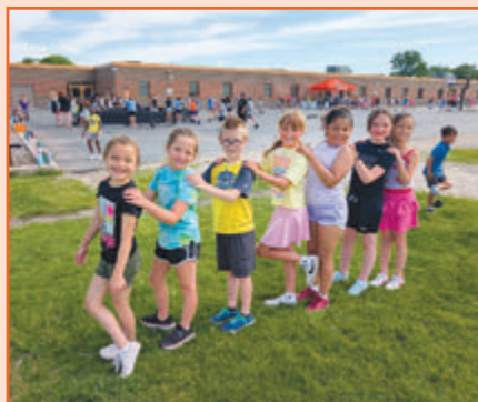
Westwood students enjoy Play 60