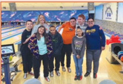
Middle School Functional Skills students worked hard running their donation-in-kind Phantom Fun Corner, and they went bowling to celebrate!