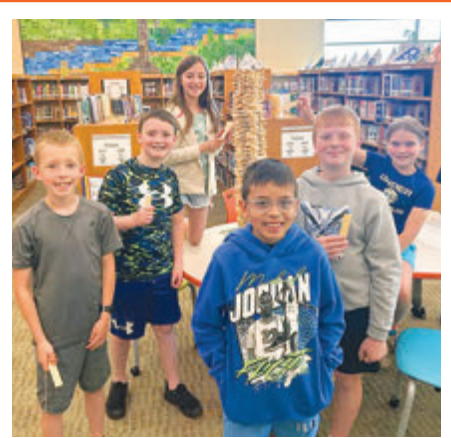
Hemlock Creek students having fun with Keva planks