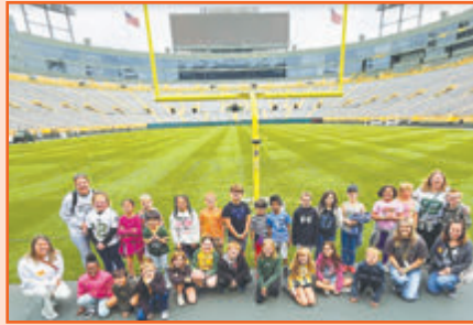
Westwood students visit Lambeau Field