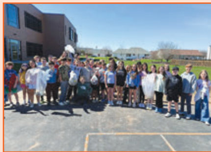
Intermediate School rolled up their sleeves and cleaned up school grounds for Earth Day