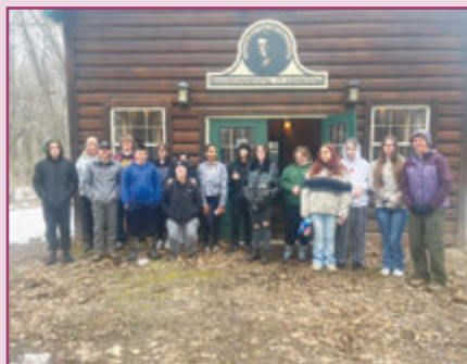
Phantom Knight students explore at Fallen Timbers