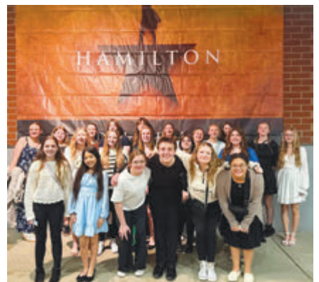
8th grade choir students visited Fox Cities P.A.C. to see the Broadway musical "Hamilton."