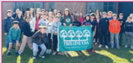
Intermediate School students planted a maple tree at the school for Arbor Day