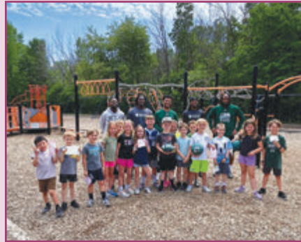
Hemlock Creek received playground equipment today (footballs and kickballs) from the Green Bay Blizzard and their generous partners at Total Energy Systems