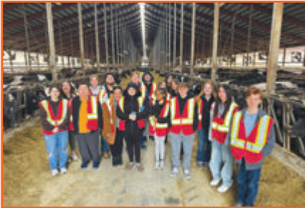
High School students visit Tidy View Dairy for a up-close look at large animal agriculture