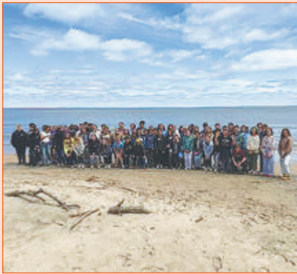
Middle School students attended the Rahr School Forest for a day of inspiration at the Artistic Retreat